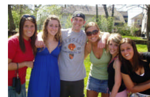
Some brothers celebrating at the fundraiser

In regards to our fundraising strategies for next semester, we are planning on doing something a bit larger. Since the plans are still in motion, you will just have to wait in suspense to see just what the brothers of Phi Beta Chi will do!