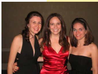
Looking good at formall

The brothers of Phi Beta Chi once again danced the night away at this year's Winter Formal.